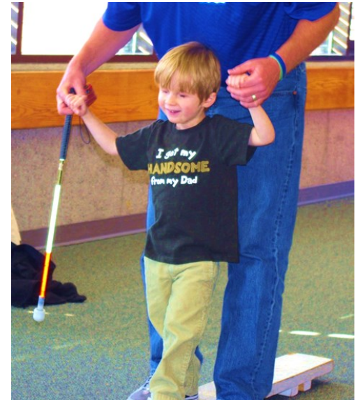
Young boy with cane walks on balance beam with assistance from his dad.